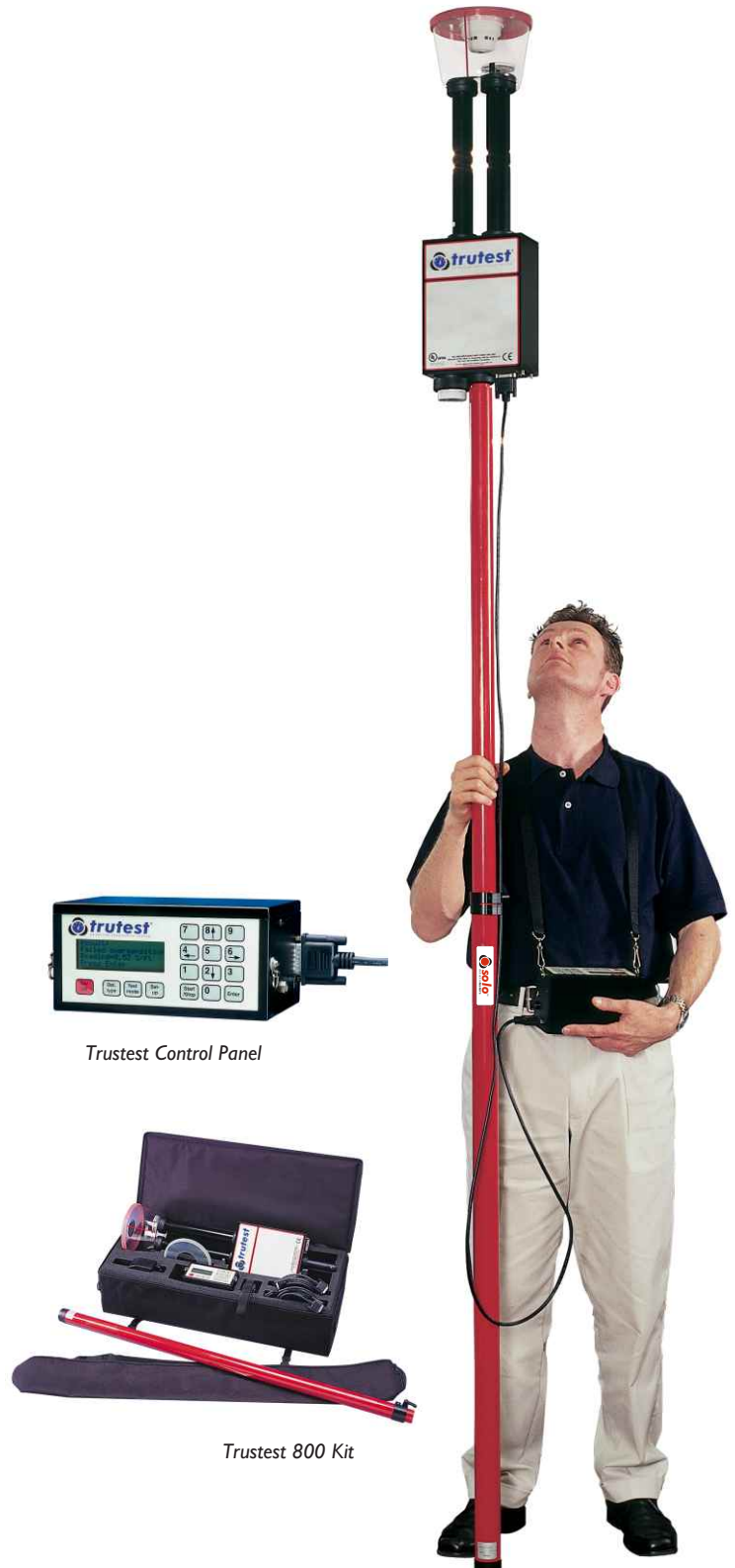
Trutest Control Panel

By introducing a measured and controlled smoke stimulus into the sensing chamber, Trutest enables cross-references to be made between the independent Trutest readings and the analog readings from the system panel. Only in this way can a true test of intelligent systems be achieved.